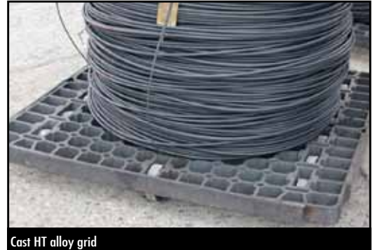
Cast HT alloy grid