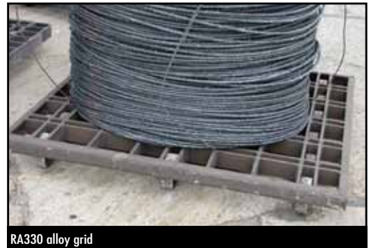
RA330 alloy grid